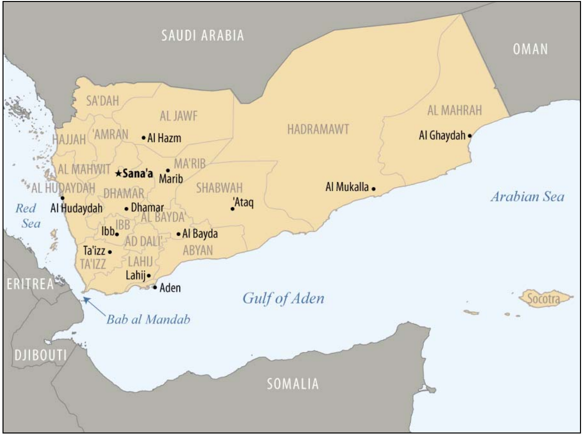
Figure 1. Map of Yemen