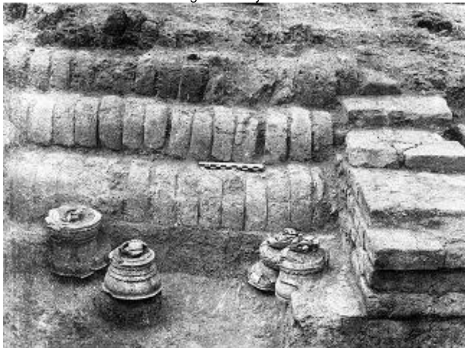
Urns at KKG-12, Beikthano