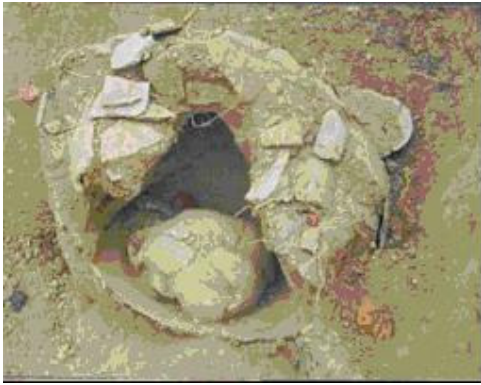
Figure 2. Nyaunggan cemetery, Budalin Township

Secondary burial with skull (above) and burial with large pots (right) Nyaunggan.