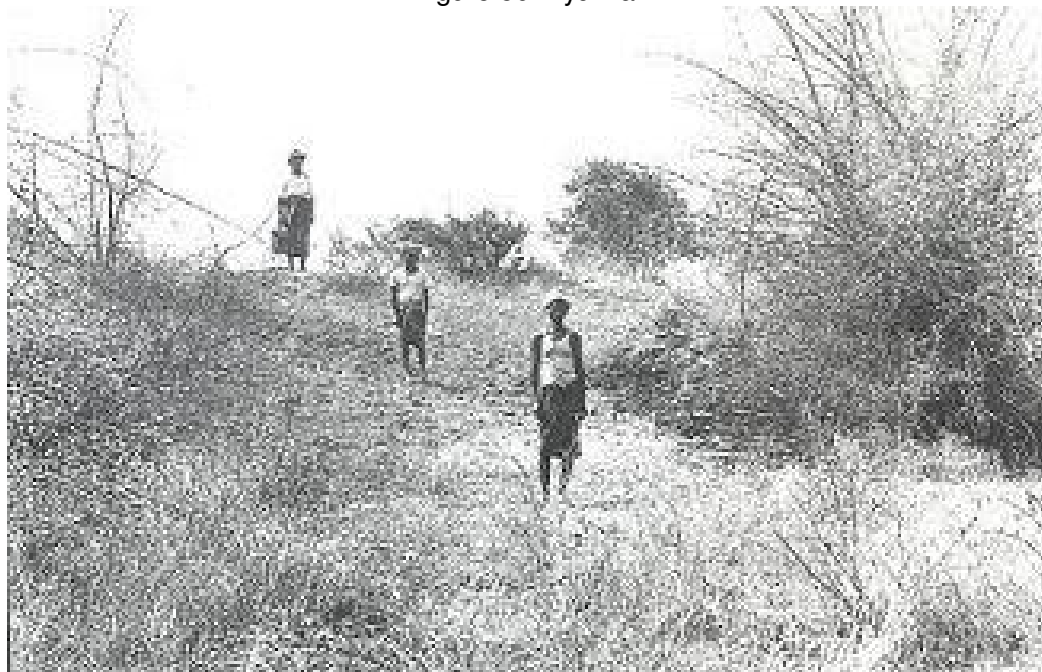
Maingmaw outer walls (c. 3.5m in places).

Within Pyu city walls, urns have been recovered on the interior and exterior of halls and stupa-like structures. Most of these buildings have semi-circular and mango sprout bricks on the stairways and exterior walls. Sometimes one or two skeletons or a pile of bones marked the cluster of urns. Some forty terracotta urns were excavated from a large hall (KKG9) south of the citadel-palace at Beikthano. This building and a similar one (KKG11) just inside the north wall gate (KKG13) have been described as a memorial structures (San Shwe 2002:16). The cremated remains of venerated persons are thought to have been gathered until burial could be carried out. Similar customs of burial deferral have been recorded in the last century among various groups in Southeast Asia. For instance, amongst the Chin, a corpse was first kept for one or two years until a feast could be held, and then laid in an open coffin raised above the ground until only bones remained. These were then gathered and placed in an earthen pot (Carey and Tuck 1896:193).