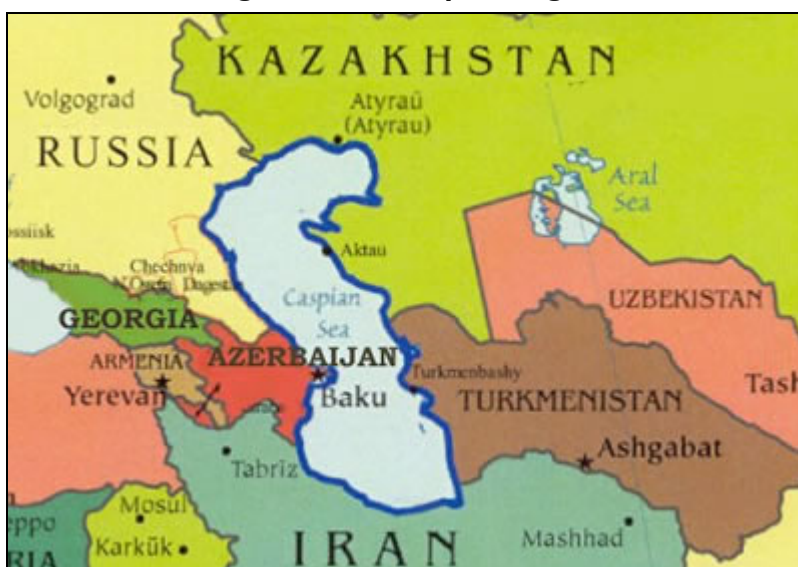
Figure 4. The Caspian Region