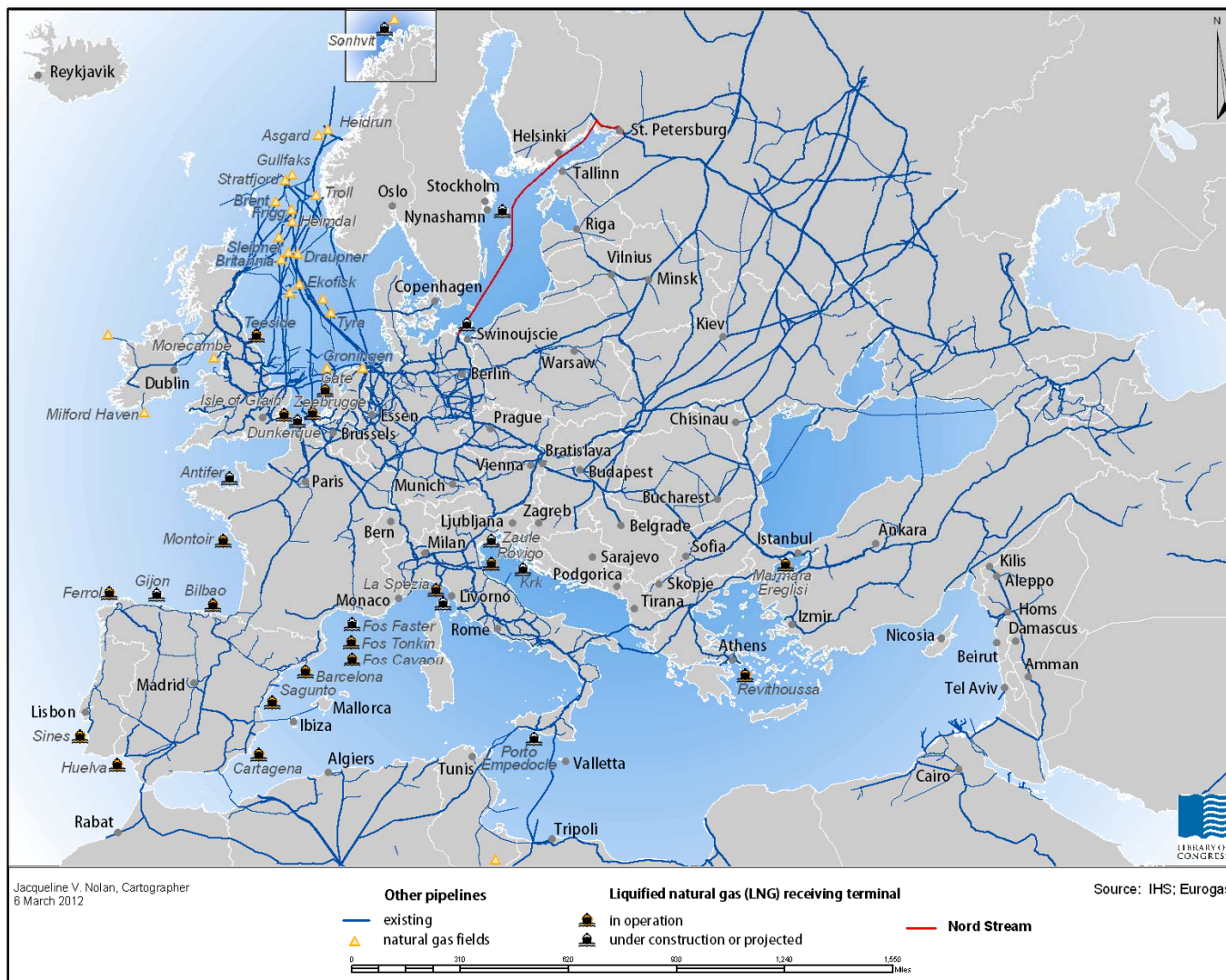
Figure 3. Select European Natural Gas Infrastructure