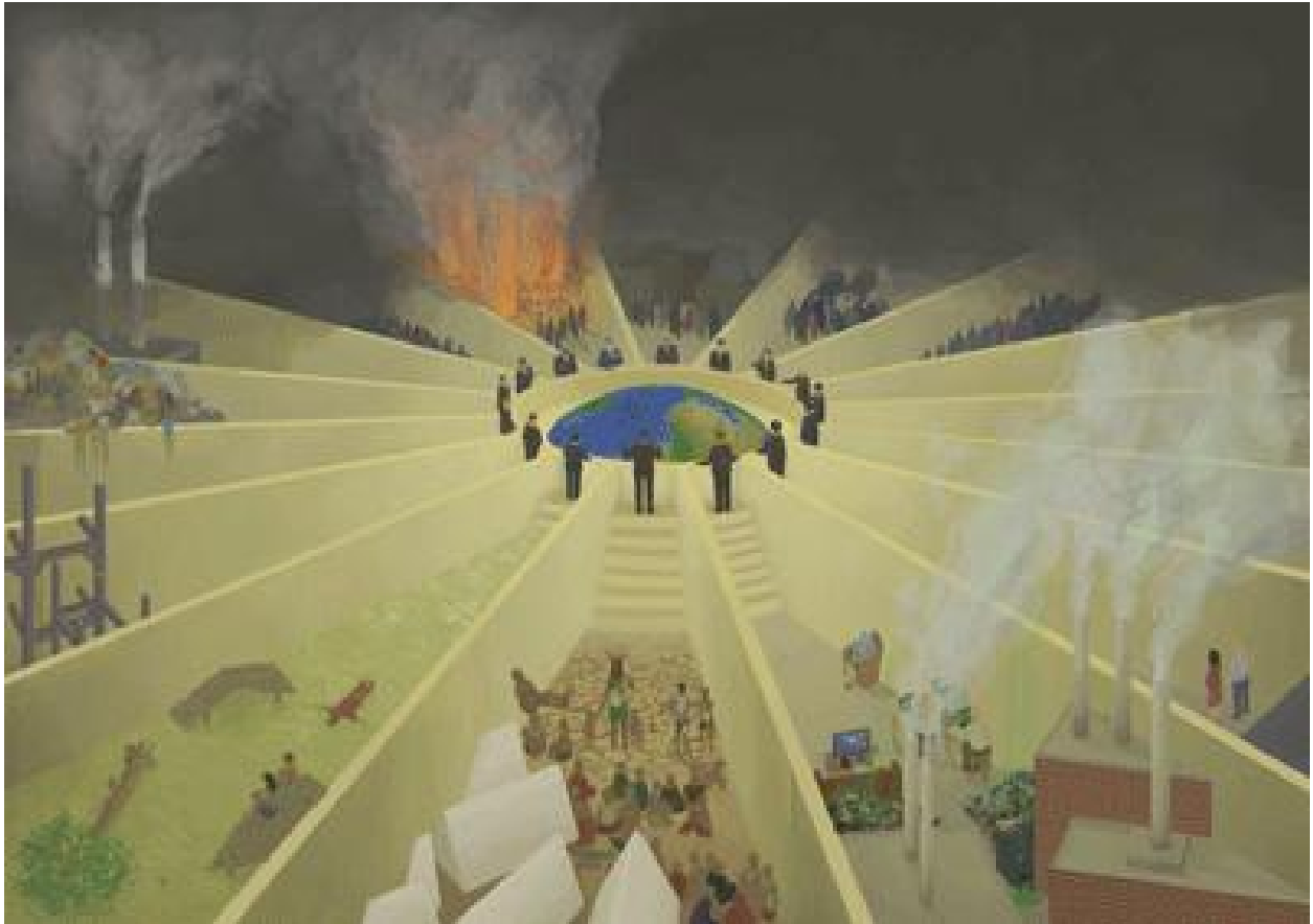
Figure 11: A painting representing the work of the United Nations. It won first prize at a UN Day Student Peace Prize event.