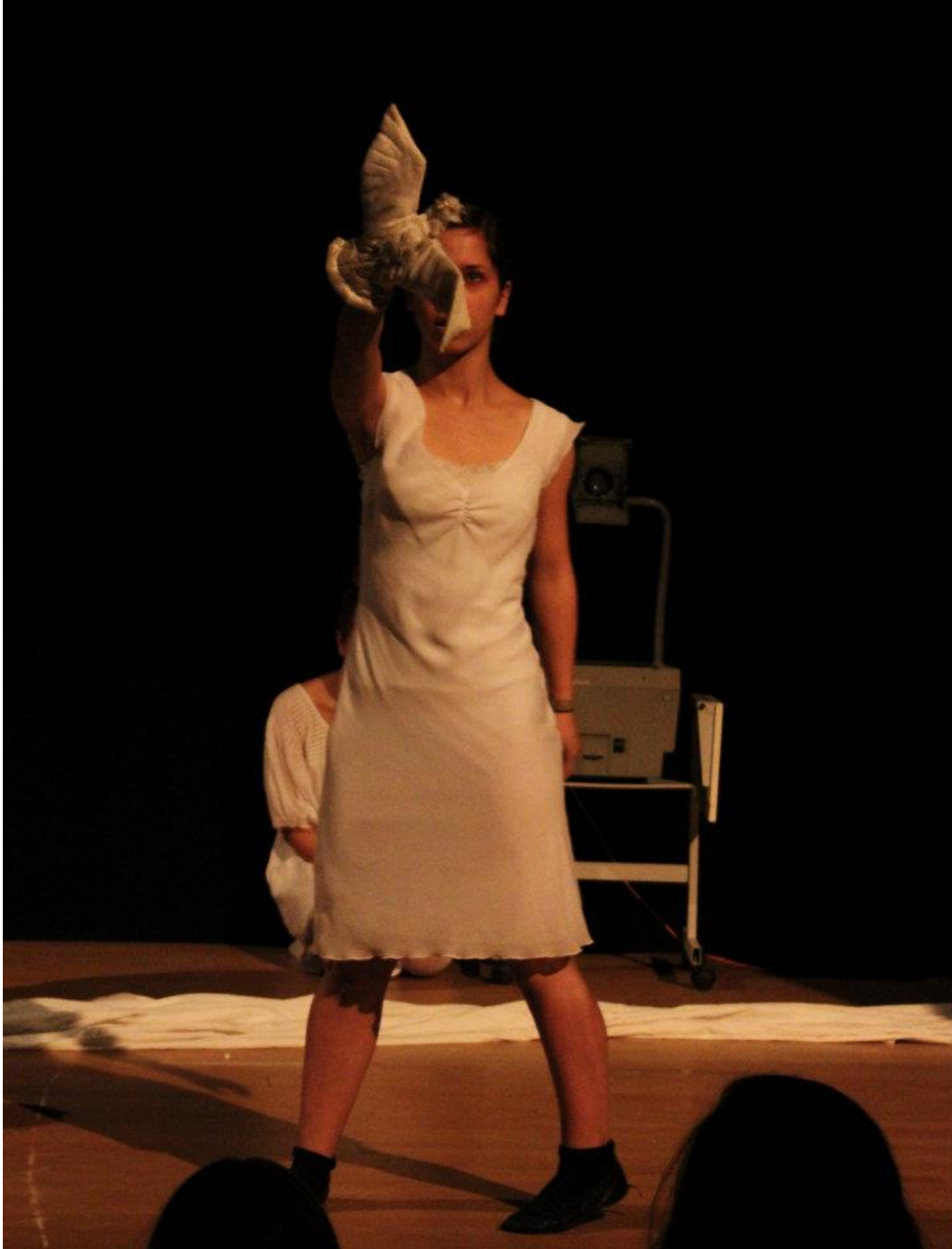
Figure 6: United Nations Day at Sankt Annæ Gymnasium.