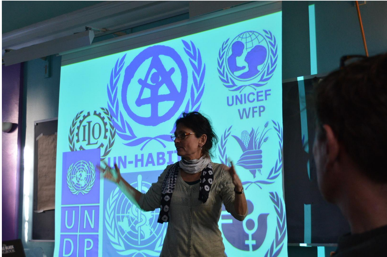
Figure 3: United Nations Day at the International College in Helsingør.

about the day. The judges have said that they would be willing to work with us again on peace-related cultural events.