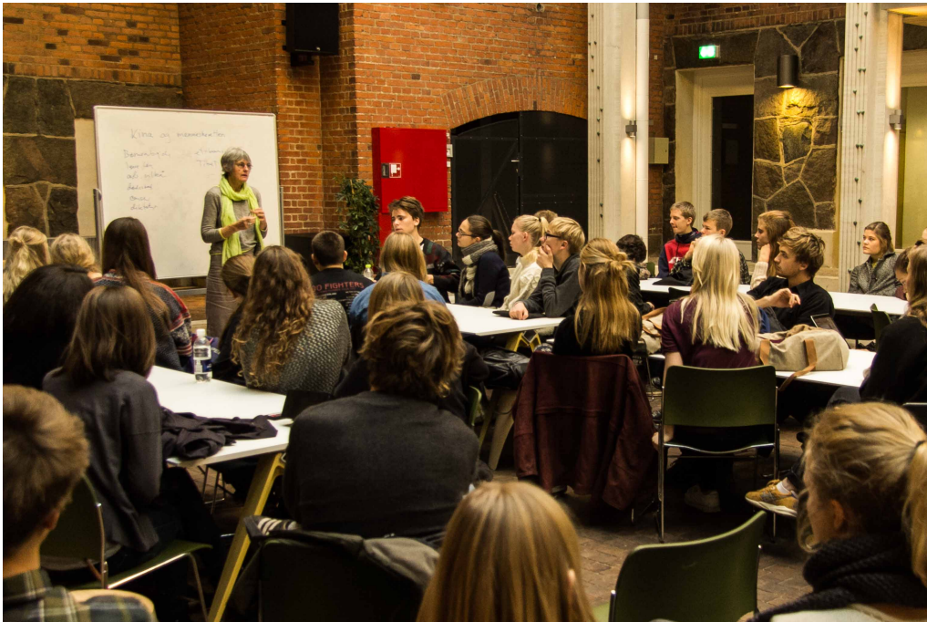
Figure 10: Student Peace Prizes at Bagsværd Gymnasium.