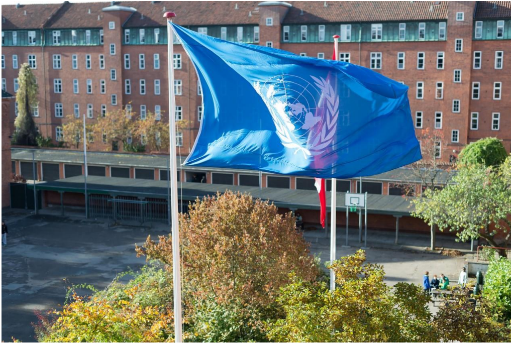
Figure 7: A flag flying in front of Sankt Annæ Gymnasium on United Nations Day.