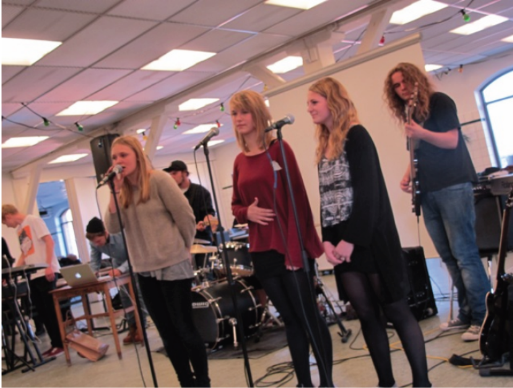
Figure 9: A group of peace-singers at Christianshavns Gymnasium.