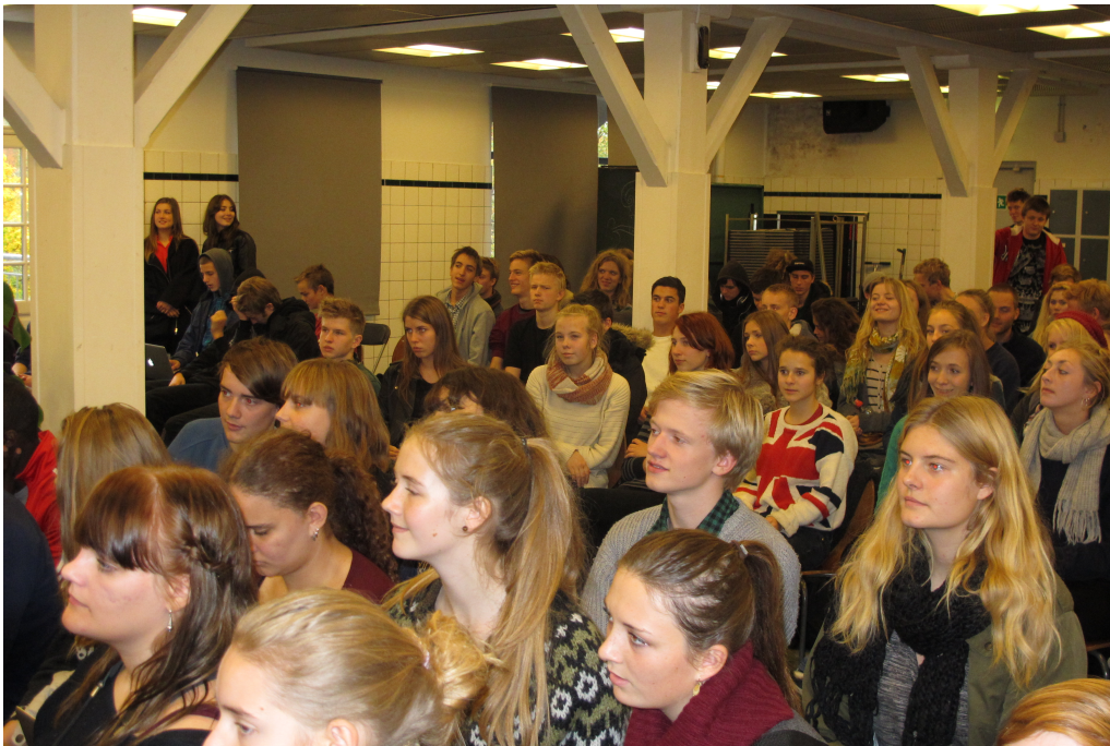
Figure 8: United Nations Day at Christianshavns Gymnasium.