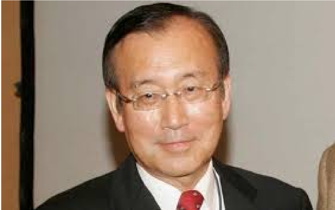
Figure 1: In 2007, we decided to invite Dr. Tadatoshi Akiba, the Mayor of Hiroshima, to visit Copenhagen.