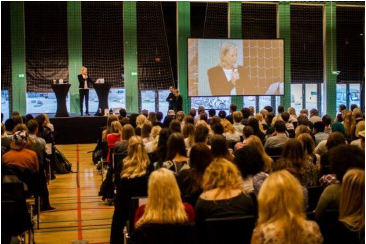
Figure 5: United Nations Day at Rysensteen Gymnasium.