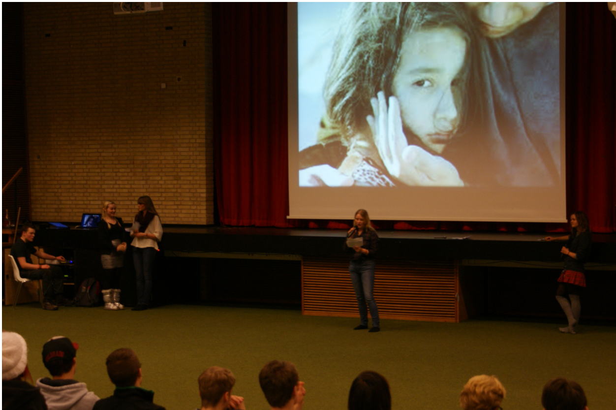
Figure 4: Student Peace Prizes at Frederiksborgs Gymnasium.