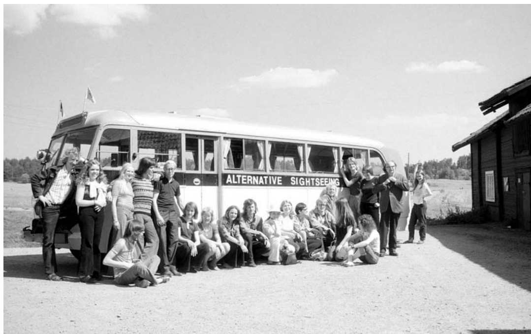
Alternative sight-seeing bus organised by Alternativ stad to show visitors environmental problems that the authorities prefer to hide during UNCHE

organisational strength and made the environmental movement more aware of politics and issues of social justice. In this process people like Anil Agarwal from India, who participated with the other third world representatives at the Environmental Forum played an important role. 92