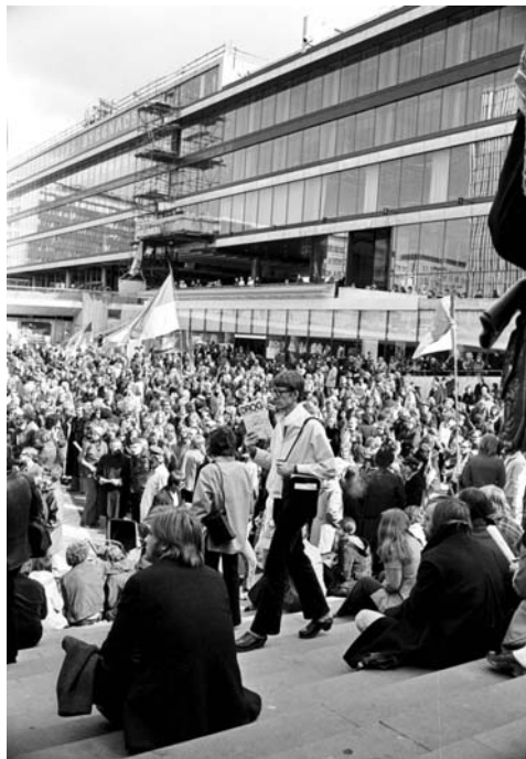
Start of mass demonstration against US war in Vietnam. Activist sells Drog (Drug) – a paper from Förbundet mot droger (The League against Drugs) - the firmest opponents against Hog Farm.

In May 1st the biggest demonstration since World War II was organised in Stockholm. Five weeks before the UN Environmental Conference the two strands of the anti-Vietnam war movement joined hands in a common and unprecedented demonstration. The final meeting gathering 50.000 participants took place right outside Folkets Hus, the venue of the coming UN conference. The more established popular movements and the governing social democratic party had accepted the more radical demands of the youth radical left movement of not saying only peace in Vietnam but also specifying the US as an aggressor that had to withdraw from Indochina.