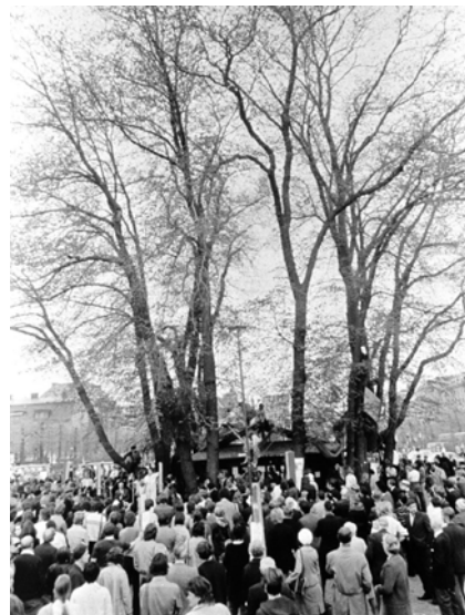
Popular celebration at the Elms

The Powwow group started building their contacts in early 1971. At Easter a Powwow manifesto was finalised and translated into several languages. The platform opened up saying that "[o]ur planet is ruined. Economic growth has become a God in whose name all living is withering away, natural resources plundered and man enslaved." The manifesto points at both that "we must create a new way of life" and that "now we must find new ways of production that allow us to live with the resources of the earth instead of poisoning and eroding them." and "we must solidarise us with the oppressed fighting for their liberation in poor countries and at other