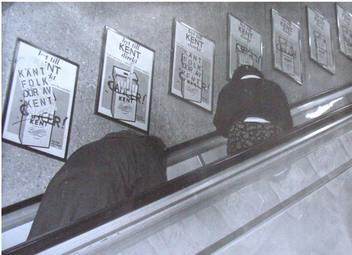
Antitobaccoactivists adding cancerinformation to advertising in the subway of Stockholm