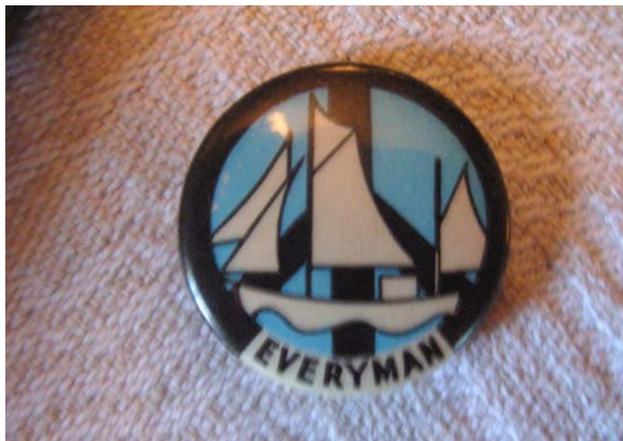
Button for Everyman III

The young theosophists continued to live in the midst of international contacts and Indian inspiration. In 1961, a meeting in Lebanon established the World Peace Brigade according to Gandhian thoughts. The Asian section intervened in the Chinese – Indian border conflict being harassed by both governments. A training camp was set up in Tanzania. Here a team should be sent to Northern Rhodesia to intervene non-violently in the conflict between white settlers and the black majority. At Tived in the forest in the middle of Sweden a camp was also set up in 1962 to train people to participate in the action. But the liberation movement was successful enough on its own and the action was called off. The third intervention by Peace brigade was to send a vessel to Soviet Union to protest against atomic weapons. The sailing ship Everyman III visited Stockholm and the crew stayed at von Malmborgs’ house in Saltsjöbaden both on its way to Leningrad and on their way back.