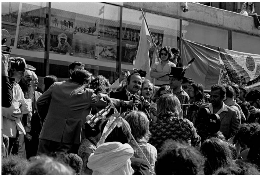
Maurice Strong at a demonstration organised by Life Forum in Stockholm 1972