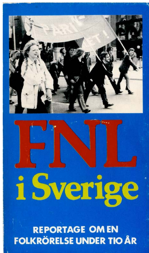
FNL in Sweden – A reportage of a popular movement during ten years - The book with the story how Satyagraha inspired the antiimperialists in Sweden.

But at the most crucial point in the anti-imperialist movement, Satyagraha became the explicit tactic used in the battle for freedom of speech and changing Swedish politics away from imperialism.