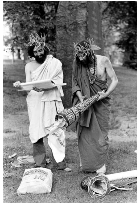
Pollution Olympics at UNCHE. 86

For the established NGOs the follow-up of the Stockholm conference was times of open doors. Conference after conference was held where they were invited to discuss how the cooperation between UN and NGOs in the environmental field should continue. Also at the regional level in Western Europe an intermediary organisation started 1974 in Brussels to influence EEC and disseminate information having its roots in discussions at the Stockholm conference, the European Environmental Bureau. On the global level the result was finally the creation of Environment Liaison Center (ELC, Later ELCI, the I added for International) with its headquarter in Nairobi at UNEP. The ideology of the NGOs is already stated in the characteristic part of the name, liaison, middlemen between popular and other environmental organisations and the UN. What made Stockholm dynamic was excluded. Now organising actions were excluded as well as popular movements emphasising Their own role as changers of society criticising business, politicians and the UN.