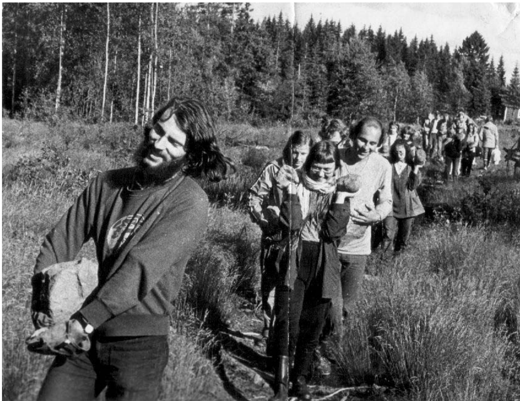
Activists carrying stones to stop exploitation of lake at Kojjärvi 1979.