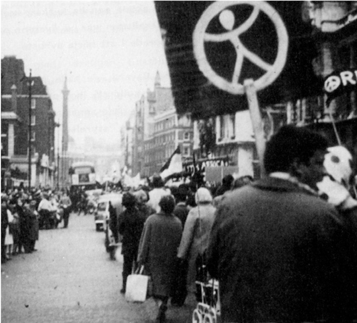
Carrying the World Citizen symbol marchers and supporters walk out of London towards Moscow 1961