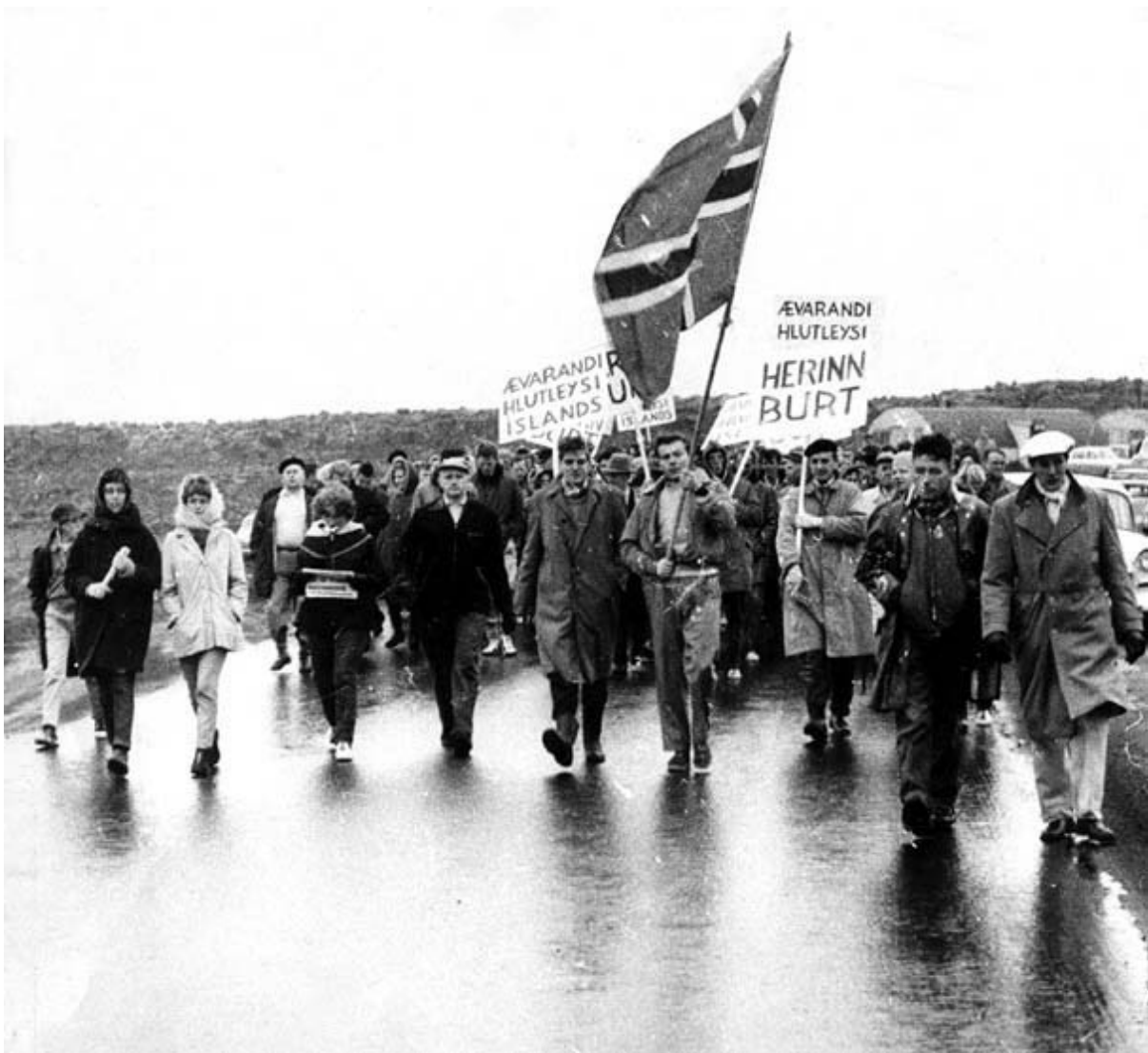
The first Nordic peace march from Keflavik to Reykjavik 1960

countries the influence came primarily through Britain. Operation Gandhi took place in front of the war ministry in London with a street sit-in blockade and collecting 136.000 signatures for a peace declaration. 1954 a mass movement grew in Japan collecting millions of signatures to protest against atomic bomb tests after a Japanese fishing boat had been hit by fall-out after an American test bomb. 1957 a single person marched from London to a nuclear site at Aldermaston followed by 800 the next year and 100.000 when the march went the other way and ended in London 1960. Bertrand Russell was a key figure both in initiating broader initiatives and himself participating in civil disobedience the Gandhian way. 20.000 activists participated in an occupation of the runways at Wethersfield air base, among them Oskarsson from the World Citizen Movement in Sweden. Hundreds of other Nordic people participated in the activities in Britain. They soon brought the ideas back home.