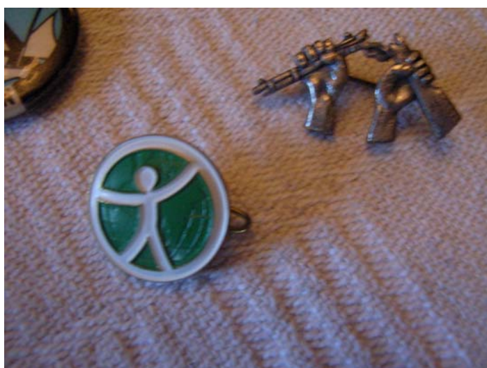
World Citizen and War Resisters International buttons