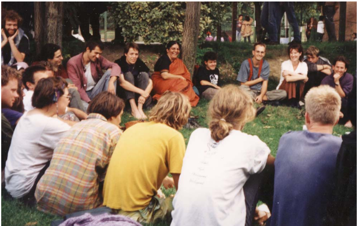
Vandana Shiva with A SEED activists in Madrid at Bretton Woods 50 years anniversary

The Finnish sustainable development critique became important to the Nordic cooperation among environmental movements in the Rio process, resulting in a more action oriented approach. At the regional preparatory conference in Bergen May 1990 Solidarity, Equality, Ecology and Development, SEED Popular Forum, was formed by Nordic popular movements. It became a gathering of more than 500 activists from more than 150 popular movements and organisations in 40 countries. It was not only organised to respond to the shortcomings of the official UNCED process but also something new in its own right to discuss common concerns and new forms of cooperation among popular movements.