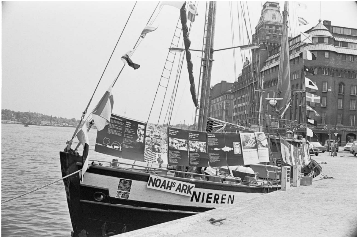
Noah's ark, Danish environmental organisation on visit during UNCHE

The Anglo-American environmentalism successfully institutionalised itself in professions and organisations like Friends of the Earth while the public opinion in both the US and UK slumped. 89 In the US the kind of dense networking between different social movements building a movement culture was not fulfilled as in Northern Europe. The influence reversed across the Atlantic and in the late 1970s Northern Europe popular movements with their occupations of nuclear power sites were inspiring the Americans at Seabrook. 90