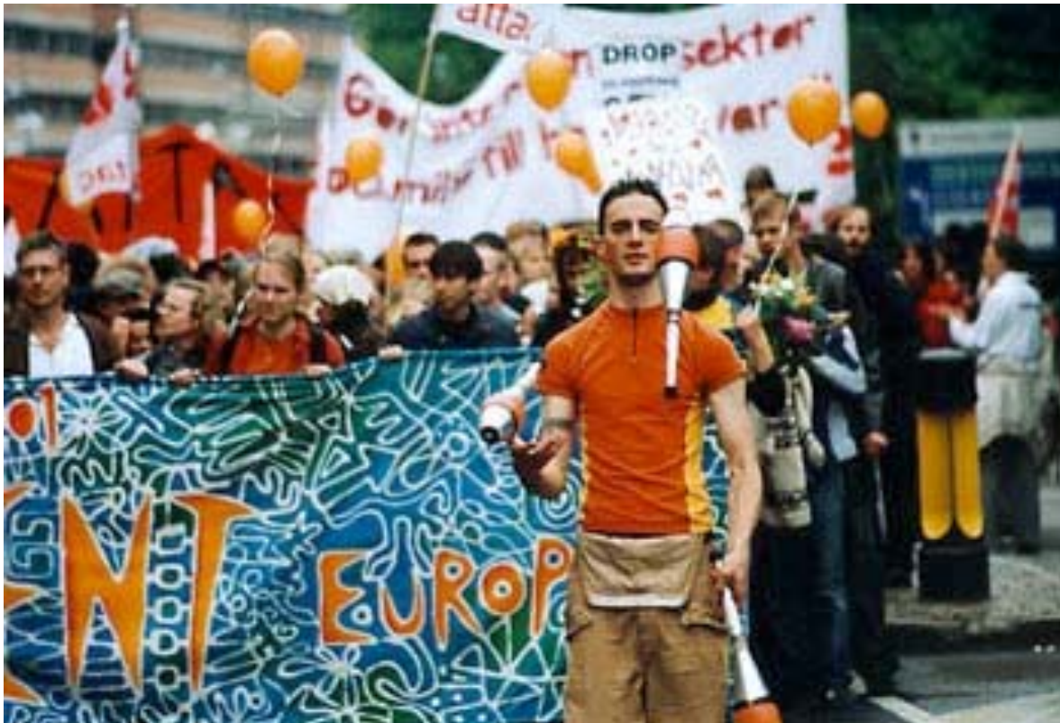
Demonstration against privatisation, militarization and European Monetary Union at the EU Summit in Gothenburg 2001

security net and public service are privatised while at the same time many people are permanently unemployed. Especially immigrants and young people are forced into precarious work or social exclusion as groups in society useful for keeping outside the more privileged positions held by the majority of people. The conflicts in society have thus developed special tensions along class lines declared as ethnic or generational problems. Racism has resulted in violence including killing immigrants, burning mosques and restricting the rights of refugees. Segregation continues to grow for every integration programme that is launched. Youth fighting against marginalisation and the privatisation of the public sphere is seen as a provocation and often ends in confrontations with the police.