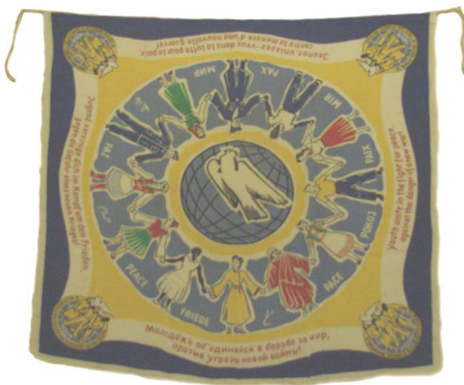
Berlin Peace Festival flag 1951

It was the anti-colonial movement where the World Youth Festival became the most important meeting point where activists from India, the Nordic countries and the rest of the world could find each other. In spite of the strong confrontations and splits within movements 1948 World Youth festivals could continue. Festivals were held after Prague in Budapest 1949, Berlin 1951, Bucharest 1953, Warsaw 1955, Moscow 1957, Vienna 1959 and Helsinki 1962 and they are still arranged today.