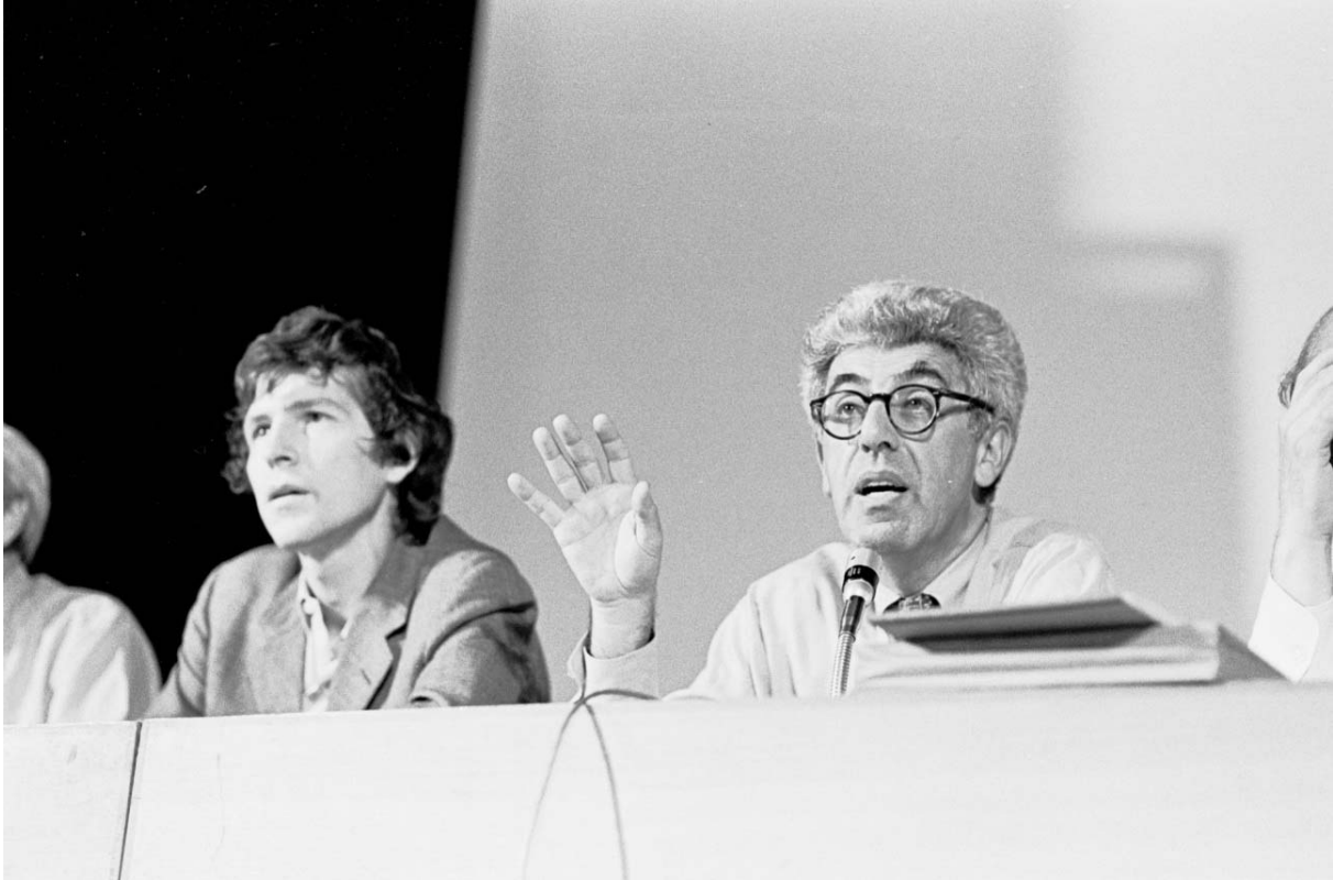
Barry Commoner at People's Forum, to the left Björn Eriksson.

The left could gradually increase its domination of the People's Forum. A polarised position was strengthened all through the conference by the interaction with Hog Farm. Even if one accepts the point of view of a strategy that maintains a strong independent position before compromising to get resources, the strategy of People's Forum is problematic in another sense. The self-chosen isolation from others that can accept money from CIA related funds is not necessarily the same as self-chosen isolation from the same group's political message.