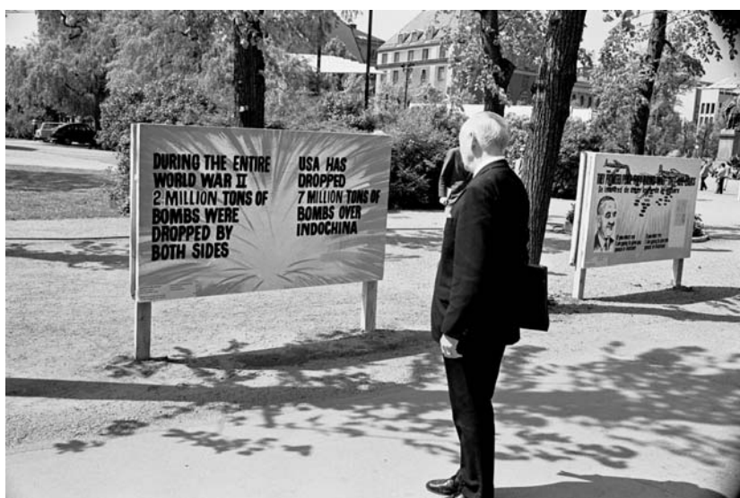
Several outdoor posters against US war in Vietnam

Some of the Anglo-American initiatives are fruitful. ECO or some kind of daily newspaper about a summit becomes a key instrument for making NGOs important and influential and a standard model for almost all coming international events beginning at a meeting on nuclear power and energy already 1972. Friends of the Earth became the strongest international democratic popular movement organisation increasingly more socially oriented as third world members joined.