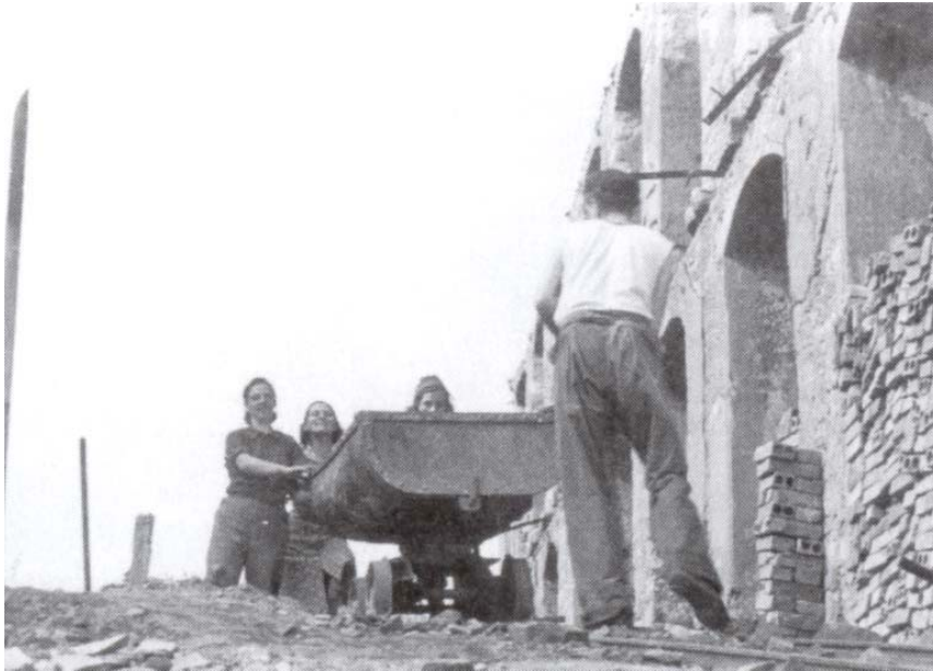
Participants at Swedish International Work Camp in Hildesheim in Germany

New national working camp organisations thus started to prepare for reconstruction work after the war built on volunteer efforts and international solidarity for peace. IAL started in Sweden 1943, Fredsvenners Hjelpearbejde in Denmark 1944, in 1949 renamed Mellomfolkelig Samvirke, Internasjonalt Dugnad in Norway states their origin already in 1939 and IAL in Finland 1947 (in Finnish Kansanvälinen Vapaeitonon Työleirijärjestö, KVT), in all countries with Quakers as central in supporting the initiatives. The Norwegians having the sharpest experiences on resistance in different forms, the Danes well-equipped, the Swedes most idealistic and wide in their concern and the Finns utterly aware of their balance position between East and West.