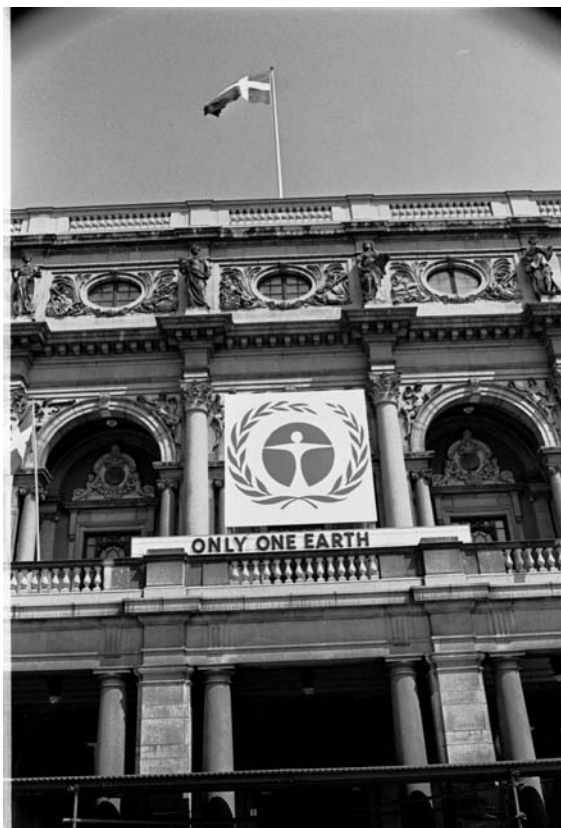
Conference hall in the old parliament building in Stockholm

Here there was Indian, but not mainly Gandhian, influence in the group that sustained the most long-term effort to support popular participation and criticism against Western models of thinking at both governmental, business and environmental movement level. But the effect on the Swedish political culture became less direct. It was at the global level this Indian Influence through a Swedish group became important, and then mainly as stopping the influence of environmental interests in direct conflict with the majority of people in the third world. It is here described more in detail although the national implications were uncertain. But the global impact deserves some attention.