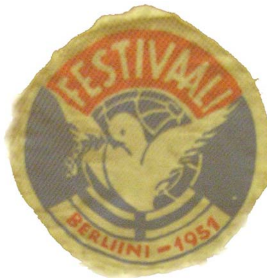
Finnish textile symbol for the Berlin Festival

The reactions against the World Youth Festivals and their organisers were strong. Both WFDY and IUS had their headquarters thrown out of Western countries from their original seats in London and Paris. No global organisation of political importance to civil society with members both in the East and the West was allowed to have the possibility of showing that they had strong roots also in the west. Committees or individuals going to the festival were regularly criminalised both in some Western countries and the South. A peak in the repression was reached at the Berlin festival 1951 when the West German border police with all means stopped thousands of West German youth from crossing the border. But many sneaked in anyway while one died in his attempt to cross the borders when the police forced a group of youth out into the Elbe River. In Communist countries connections with the other side of the bloc division was also suppressed, often more severely.