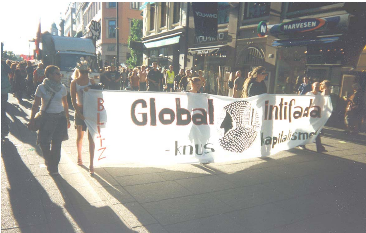
PGA activists at anti World Bank demonstration in Oslo 2002: Global Intifada – Smash capitalism

The left can handle this situation easier in the short term than the alternative movement built on more civilisation critical and Gandhian traditions. The left have their different parliamentary and revolutionary traditions polarised against each other to fall back upon offering the radical activists the choice they prefer. For Gandhian inspired movements the situation has been more difficult at least in short terms. Gandhi is split in two. Only one half is used as a repressive argument against those that do not live up to individual perfection in the face of police repression and lack of collective solidarity. The other half demanding constructive work and unity among oppressed as well as a stronger criticism against those passive than against those using violence is forgotten.