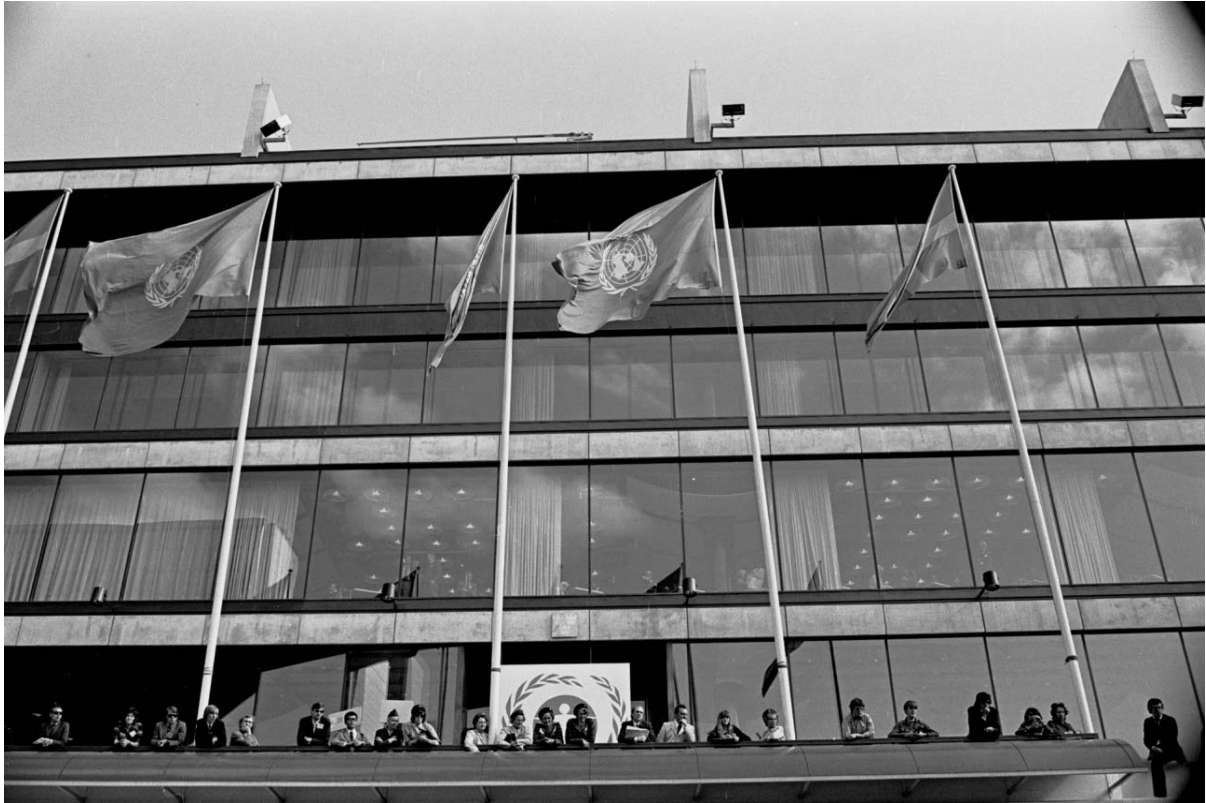
UN conference at the new parliament building at Sergels torg 1972

its close collaboration with Aspen Institute. Strong had a key role at both Aspen Institute, IIED and other organisations as the Trilateral commission initiated by Rockefeller aiming at uniting the interests of the leading businessmen and politicians in Japan, Europe and North America. Business was well-placed and institutionalised for continuing their work for a conceptual framework of global environmental problems compatible with their interests.