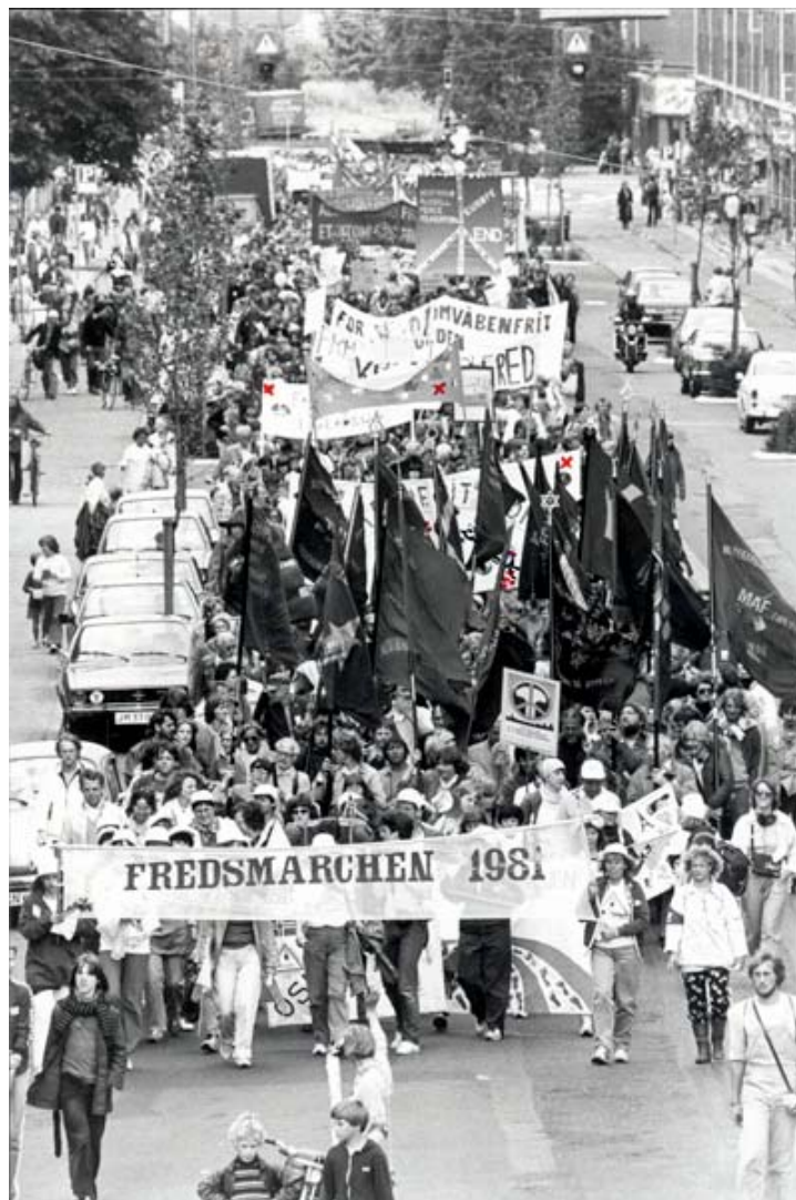
Peace march 1981 walks out of Copenhagen towards Paris