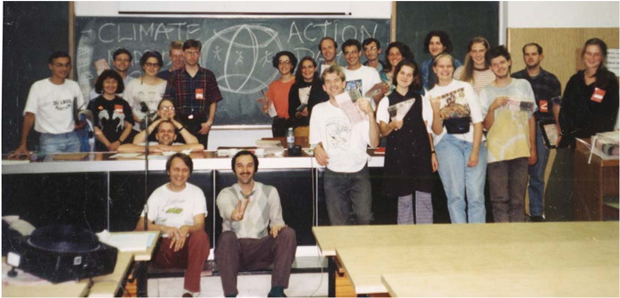
International Climate Action Day meeting in Madrid 1994.

Helsinki and Tallin. Here, more in depth discussions were carried out in the Sauna, in the lake and other indispensable place for philosophical interchange on what is development, what alternatives are there, Gandhian socialism and practical mobilisation. Unfortunately (or good?) a report never came out of the seminar but linkages were built on an international scale opposing the sustainable development model and proposing mass mobilising padyatra marches and local action days. Climate action days was successfully carried out in 70 countries and 500 places around the world through the Swedish Finnish cooperation as well as strengthening broader initiatives like Alliance of Northern People on Environment and Development, ANPED ahead of the United Nations Conference on Environment and Development in Rio de Janeiro.