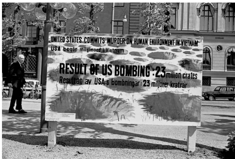
Outdoor propaganda against US bombing during UNCHE

In spite of the tensions due to internal contradictory intentions from the official initiators and insecure practical arrangements the result was that Environmental Forum became an arena for independent voices from all over the world. The program and participation was such that it also by today's standard is surprisingly wide and relevant. The internal controversy among the Swedish organisers did not change a common attitude in relation to the importance of criticism of American involvement in the Vietnam War and third world opinions except when it came to the take over of the population panel. Without the change in some favour of the third world the program would have been biased towards American interests.