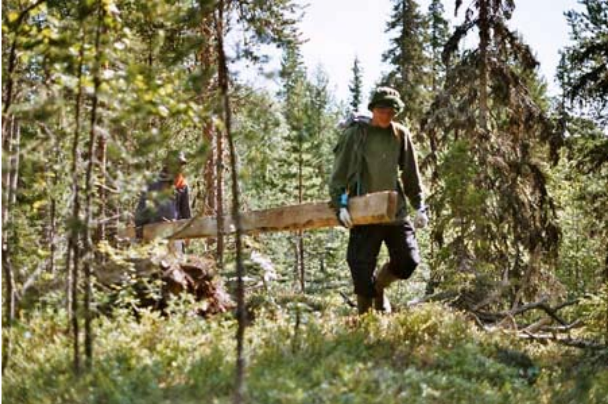
Carrying planks for the foot-bridge on the Solovetsk islands 2004

50 persons carried planks surrounded by mosquitoes. It was an atmosphere worthy of these islands. Here a monastery was built in the 15 th century by orthodox monks, a well fortified establishment where the tsar sent his most important political prisoners, later followed by Stalin who used it as the first Gulag, again for political prisoners.