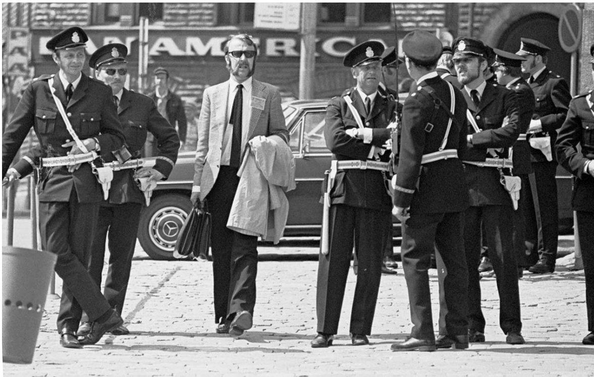
Well protected UNCHE delegate arrives