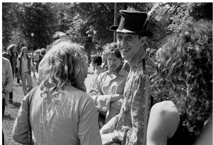
Stewart Brand in Stockholm 1972

Another American intervention came in March from Life Forum represented by the Kaplan Fund and the multi-millionaire Stewart Brand, a Californian drug liberal that became rich when making and selling the alternative lifestyle Whole Earth Catalog. The Kaplan fund had been used since the beginning of the 1960s to channel CIA money in the interest of the US government. Life Forum met People's Forum, Environmental Forum and the police. The authorities saw the Americans as a possible help in a problematic situation and especially