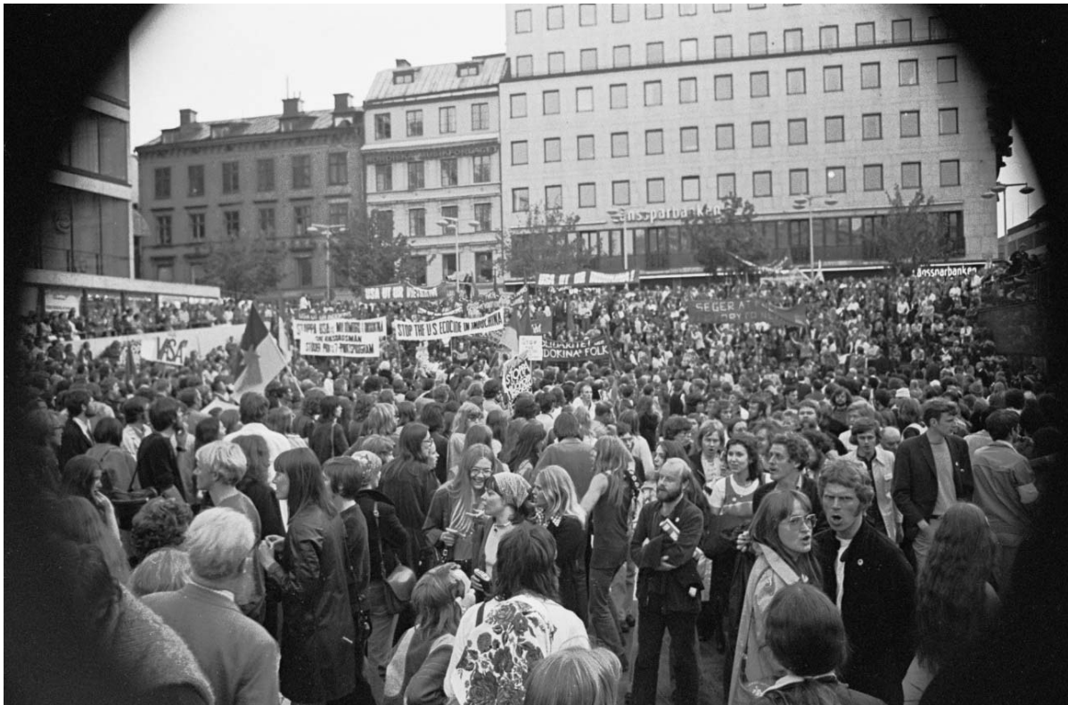
Demonstration against US ecocide in Vietnam

The US press was afraid of the conference and wrote that: "It will provide a conspicuous soapbox for demonstrators against the US role in Vietnam." For the joint Swedish and American anti-Vietnam war movement, the UN conference was a success. The FNL movement had strong influence at both important public fora, the People's Forum and the Environmental Forum. The many years of polarised relations with the Swedish Vietnam Committee ended with the many actions in cooperation taken during the conference. The American critical voices against ecocide in Vietnam were welcomed everywhere except at the Hog Farm headquarters at Skarpnäck. Demonstrations, a special Swedish hearing on ecocidal warfare, interventions by NGOs and governments in the official proceedings and the Dai Dong effort accumulated a strong effect.