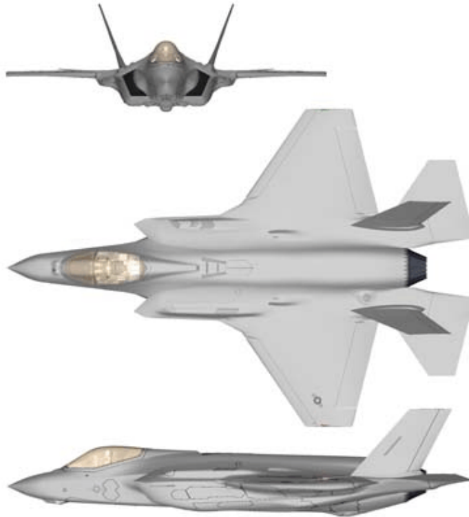
Figure 1. F-35 Lightning II Joint Strike Fighter

capabilities. 4 To date, however, the Air Force has not committed to purchasing other variants besides its CTOL platform. While speculation continues as to the procurement intentions of the USAF (the largest purchaser of the F-35), the Air Force official position still remains at 1,763 CTOL F-35s. 5